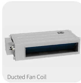
Ducted Fan Coil