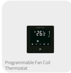
Programmable Fan Coil Thermostat